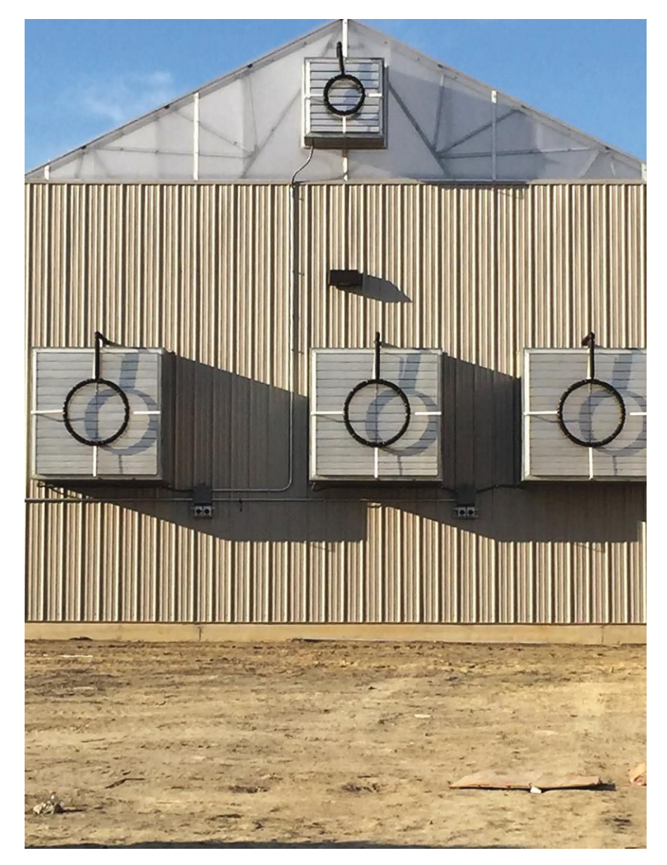
POINT OF SOURCE: The majority of Fogco systems utilize the point of source odor elimination concept, so they are incorporated into the operation of the exhaust fans of a facility.

producing organic compound) most frequently found in cannabis.