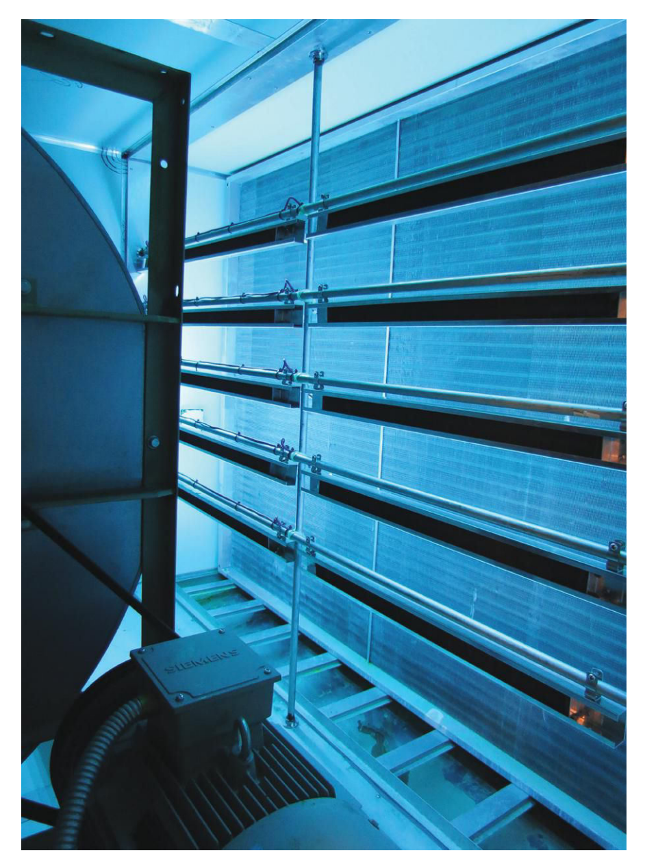
DISINFECTING WITH UVC: The APCO disinfection-odor control installed in the AHU disinfects and reduces odors with proprietary UV-C and carbon ceramic lifetime tiles.

no airflow restriction, and the only consumables are the UVV lamp that needs replacement every two years. It's a low-cost, easy installation that works exceptionally well."